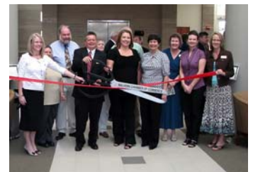
September 19, 2008