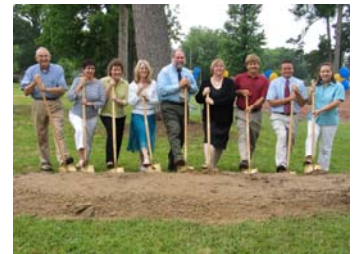
June 19, 2007