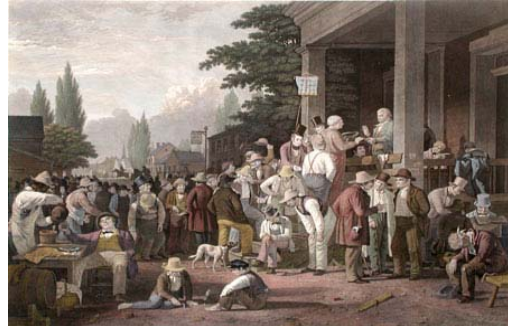
The County Election, 1852

ence the humanity of history and enhance the teaching and understanding of America's past. To view the display, visit the OTC Library Monday-Thursday, 7:00am-5:30pm.