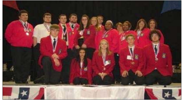
OTC High School and College SkillsUSA Teams

SkillsUSA is a national organization with chapters located in high schools and colleges throughout the United States. The students pictured received gold medals in several different areas. These students will represent Arkansas at the national SkillsUSA competition in Kansas City, Missouri, June 22-27.